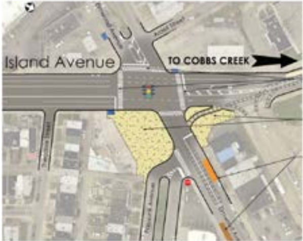
Proposed Intersection Configuration

The Streets Department has received federal funding to improve intersections along Island Avenue. The project includes upgrades to the street. These include traffic signals, reduced road widths, and a walking/biking trail. The project's purpose is to improve safety for all users of the street.