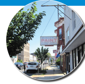
Rising Sun Avenue