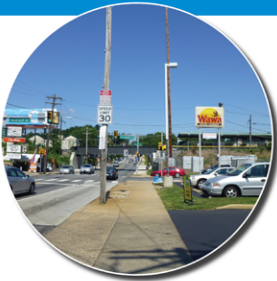
Ryers Station and Cottman Avenue